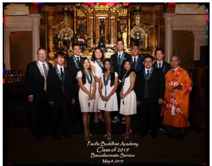
Pacific Buddhist Academy Class of 2019 Baccalaureate Service May 9, 2019