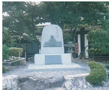
Kakushinni Memorial Stone

More photos & information are available for LHWA on our website at: https://www.lihuchongwanjission.com/organizations-activities/lihu-e-hongwanji-women-s-association/ Check it out!