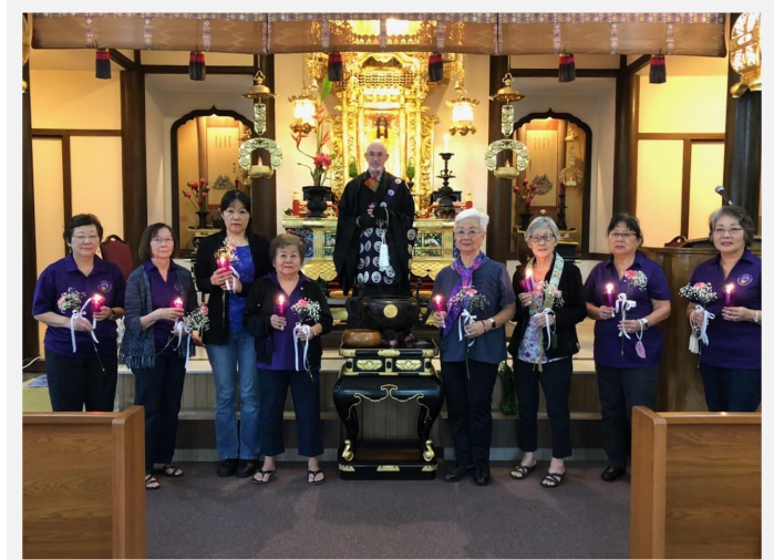
LHWA Installation, 1/12/2020