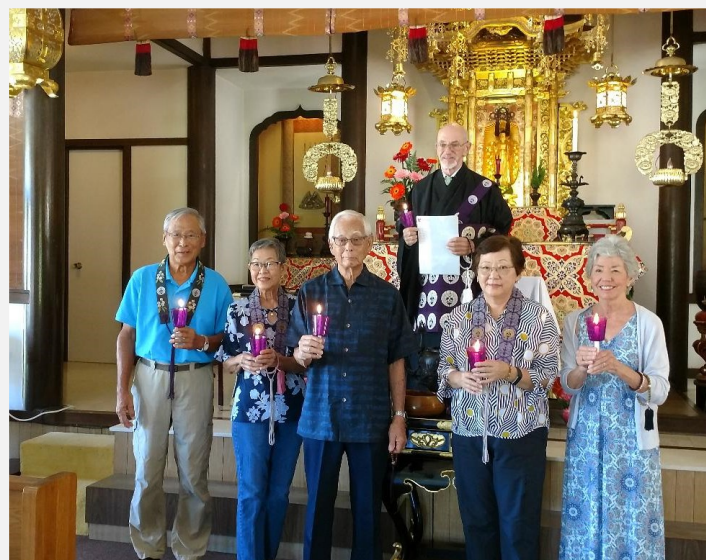
Board of Directors Installation, 1-1-2020