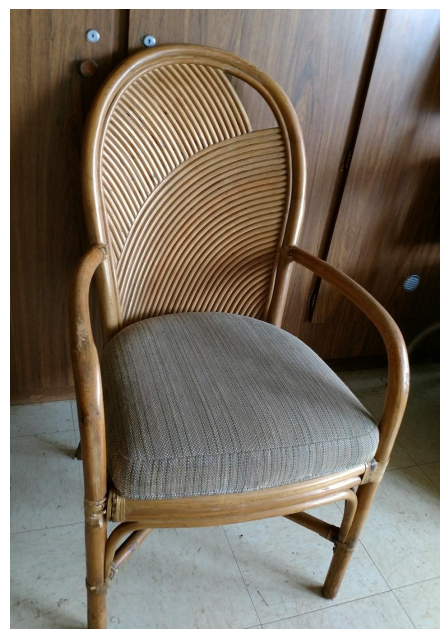
There is 1 chair of this design.