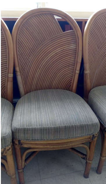
There are 8 chairs of this design.

The chairs are at no-cost but cannot be delivered.