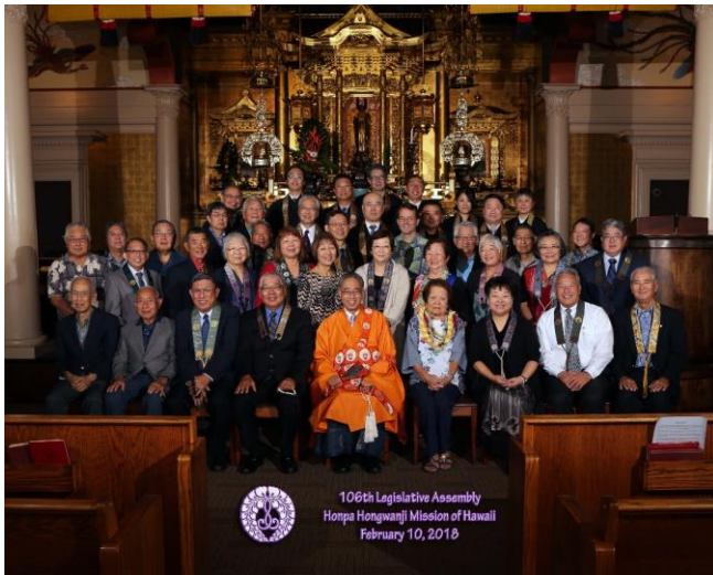
The newly installed Officers, Advisors, Directors, Sanmu and Kanji Ministers of Honpa Hongwanji Mission of Hawaii.

In closing, it is my hope that the Honpa Hongwanji Mission of Hawaii will continue to prosper and that many fruitful results will arise from this annual meeting.