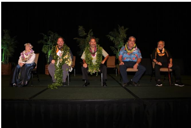
2018 Living Treasures of Hawaii Honorees