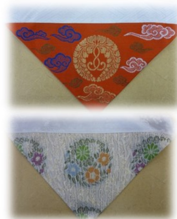
↑ Small Uchishiki for Family Altar (Butsudan)

*Numbers of supply are limited with this price.